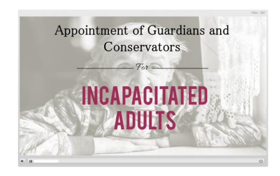
<u>Click here</u> for the Guardians and Conservators video.